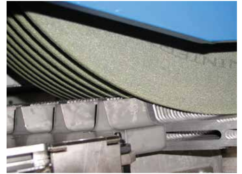
Grinding of hedge trimmers